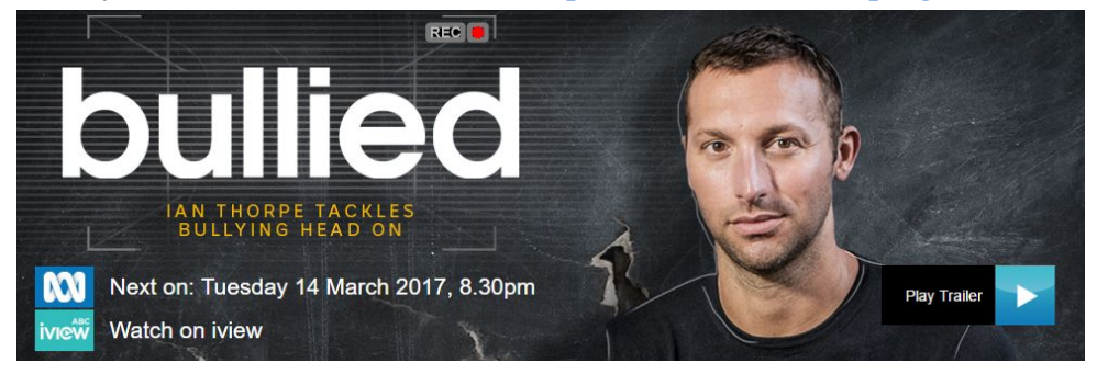
Bullied - (Currently on iview for a limited time - <a href="http://iview.abc.net.au/programs/bullied">http://iview.abc.net.au/programs/bullied</a>)

Over the last few weeks I watched some episodes of the ABC documentary on Bullying, hosted by Olympic swimmer Ian Thorpe. It is not without controversy, however, it provides an insight into the effects of bullying and the inappropriate use of social media.